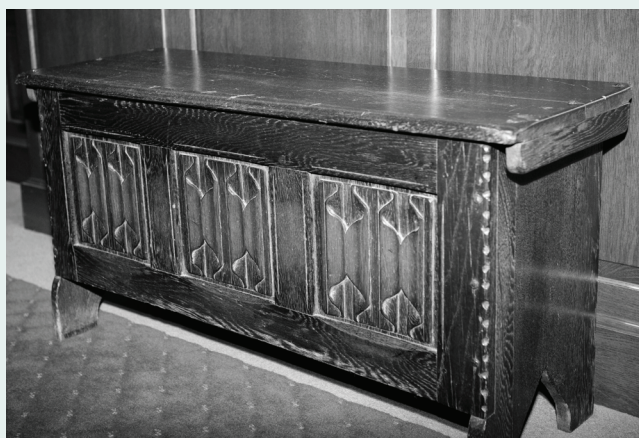
Charles Williams's chest was donated to the Wade and is now located in the museum.