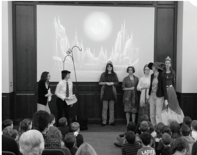
A performance of The Magician's Nephew by the Wheaton College Tolkien Society during Staycation.

Chronicles and other works by the Wade authors. W