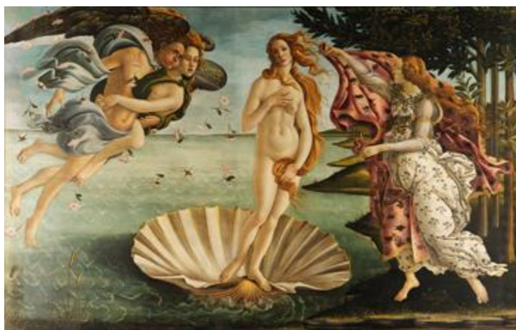
The Birth of Venus by Sandro Botticelli (1486)

She had not been a character that had been around for a while before I started the story. Not for a very long time. Like I said, there had been elements of the plot that had been offshoots from older stories, so as I’m thinking about those, I guess some of them might have been earlier incarnations of her, but not entirely. She sort of came into being completely whole like Aphrodite or something. Just, “Here you are.” Which is great, because then I had to do less work. As for further stories, I was so pleased to have that story self-contained that there’s part of me that hesitates to write more, but if I have a good idea, I’ll go with it.