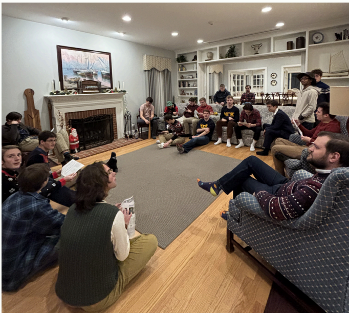
Glee Clubbers sit and chat about the semester at the annual Christmas Party.