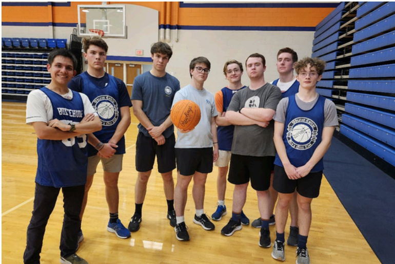
The Glee Club intramural basketball team, Buxtahoopa, enjoyed another winning season! ... All of the games were won by negative points.