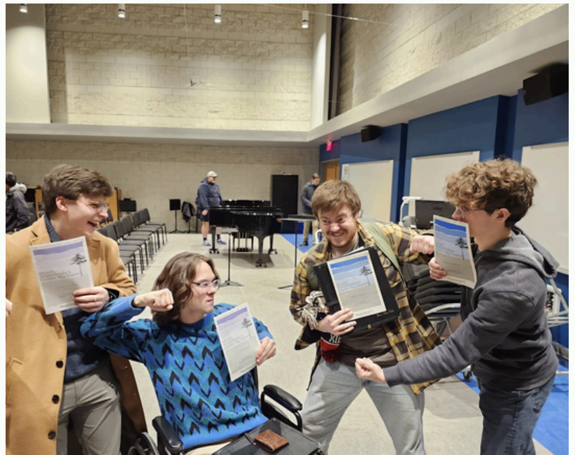
Glee Clubbers stage a fight between people with either blue or purple sheet music.