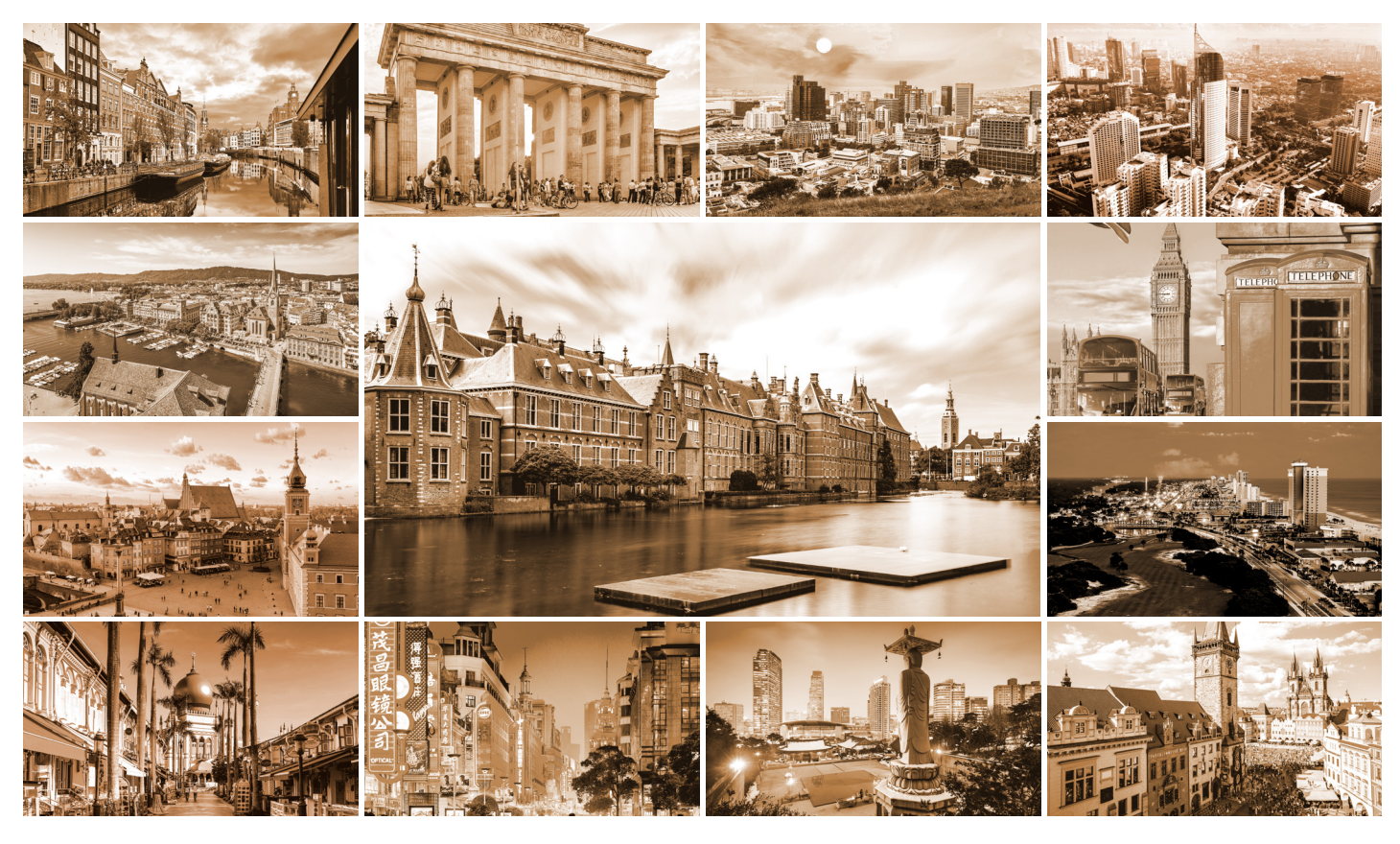
Center: The Hague, Netherlands, where ISP began. Surrounding cities are some of the places ISP has visited in the past 10 years. London, Amsterdam, Prague, Zurich, Shanghai, Seoul, CapeTown, Panama City, Warsaw, Berlin, Singapore, and Jakarta