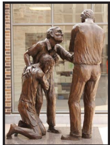
Duke Divinity School's sculpture, "Reconciliation," based on the parable of the prodigal son